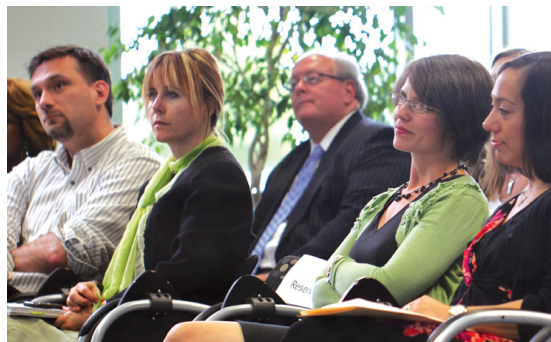
Senior leaders discuss digital innovation with employees at a LEAD event.

To succeed in the knowledge industry, we need smart, informed, diverse and committed employees who can meet our customers' evolving needs. Their talents enable us to deliver high quality products and services and maintain our leadership positions in financial and education markets.