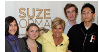
McGraw-Hill hosted personal finance expert Suze Orman to teach 400 high school students how to be smart with money.